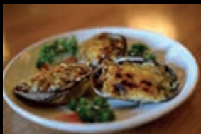
GRILLED BUTTER (CLAM) OYSTER WITH CHEESE

Nicha Restaurant offers a mix of great value Vietnamese and Chinese dishes located in the historic Victoria Hotel.