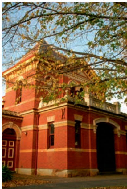
Benalla Court House