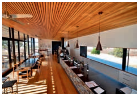
Tallis Cellar Door