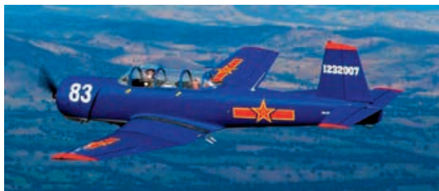
Take a flight in a Nanchang CJ - 6A