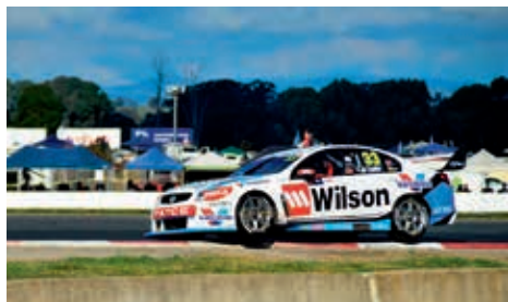
Supercars Winton Raceway

The North East Victoria (High Country) has many great adventure based operators and businesses that can assist to make your experience safe and memorable.