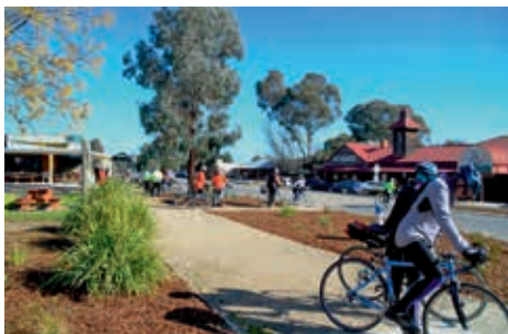
Pack the bike and enjoy the region