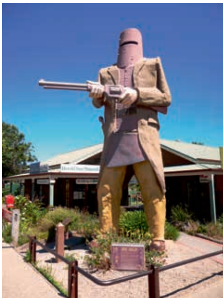
Ned Kelly Statue Glenrowan