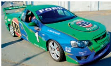
Take hot laps Winton Adrenaline rush