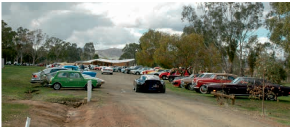
Car clubs can enjoy great driving with great places to stop