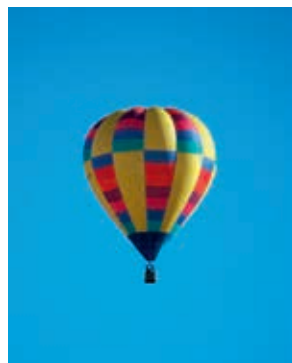
Ballooning North East Victoria