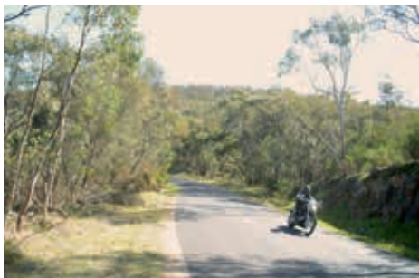
Touring by car or motorcycling great roads great views