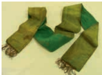
Ned's authentic sash