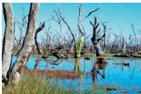
Ashmead Swamp Winton Wetlands