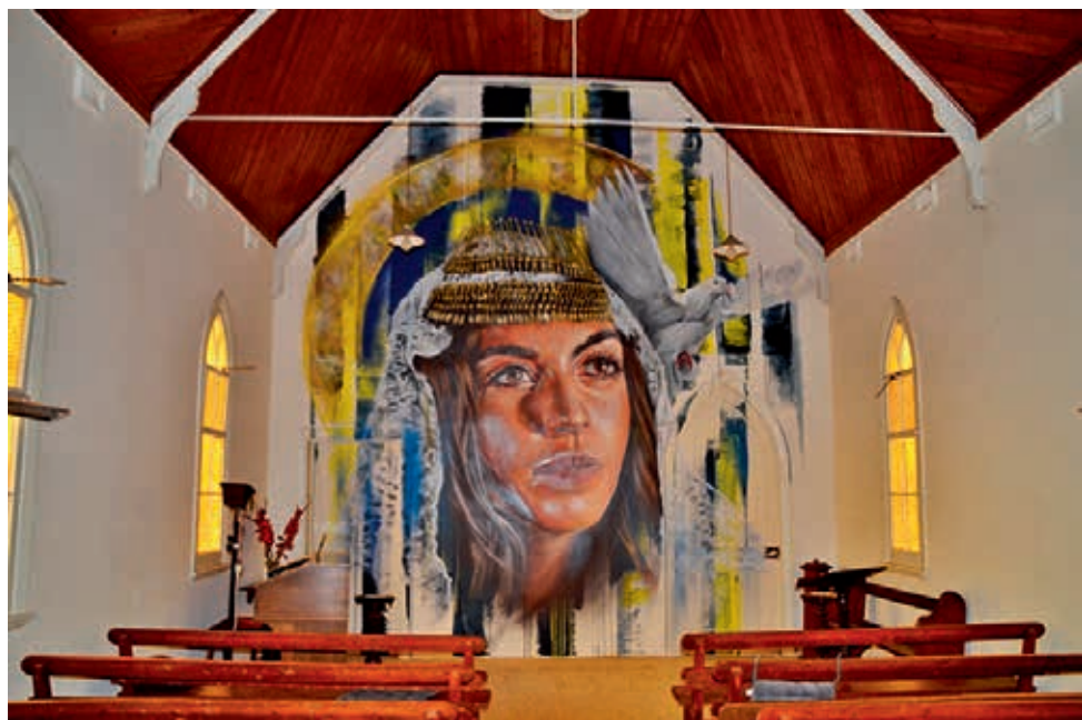
Adnate "Sophia" Goorambat Uniting Church