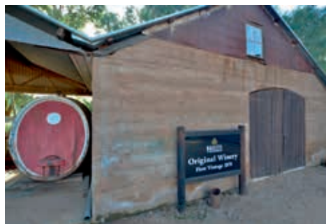
Baileys Original Winery

Across the North East Victoria (High Country) you will explore and discover the wine regions of Glenrowan, Rutherglen, Beechworth, Alpine Valleys, the King Valley, the Goulburn Valley, the Upper Goulburn and the Strathbogie Ranges. All offer not only great touring but the climate, landscape, soil and characters that make for an ultimate wine experience. Each area and winery has that must try wine, which may be enjoyed at times with the wine maker.