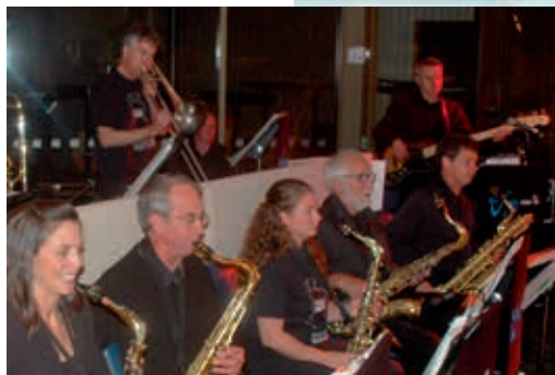
Enjoy Art and Culture in North East Victoria (High Country)