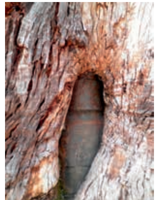
The Kelly Tree