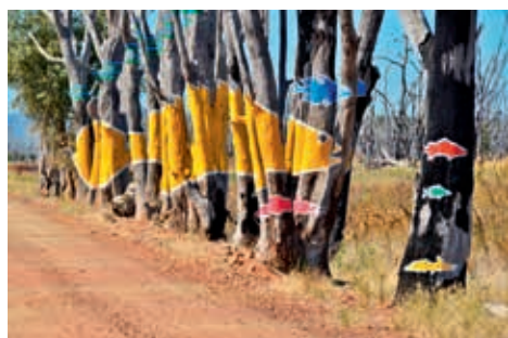
Fish - Tim Bowtell